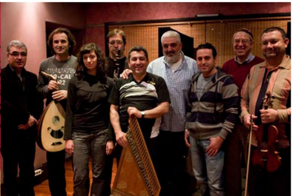
Ensemble Saltiel in studio